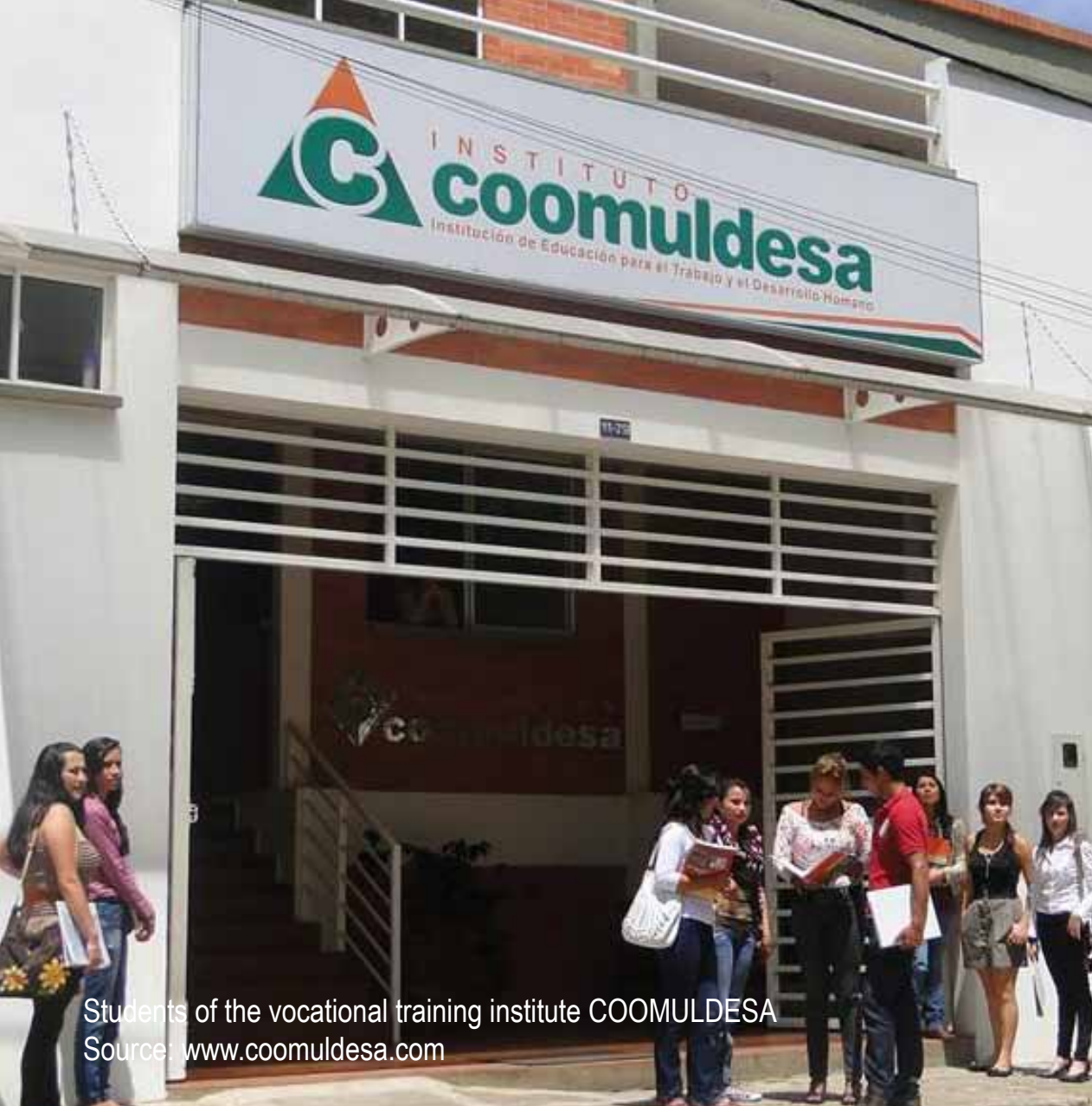
Students of the vocational training institute COOMULDESA